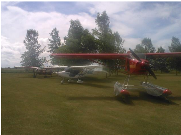
Only three planes flew to the MacPat Fly-in this year!