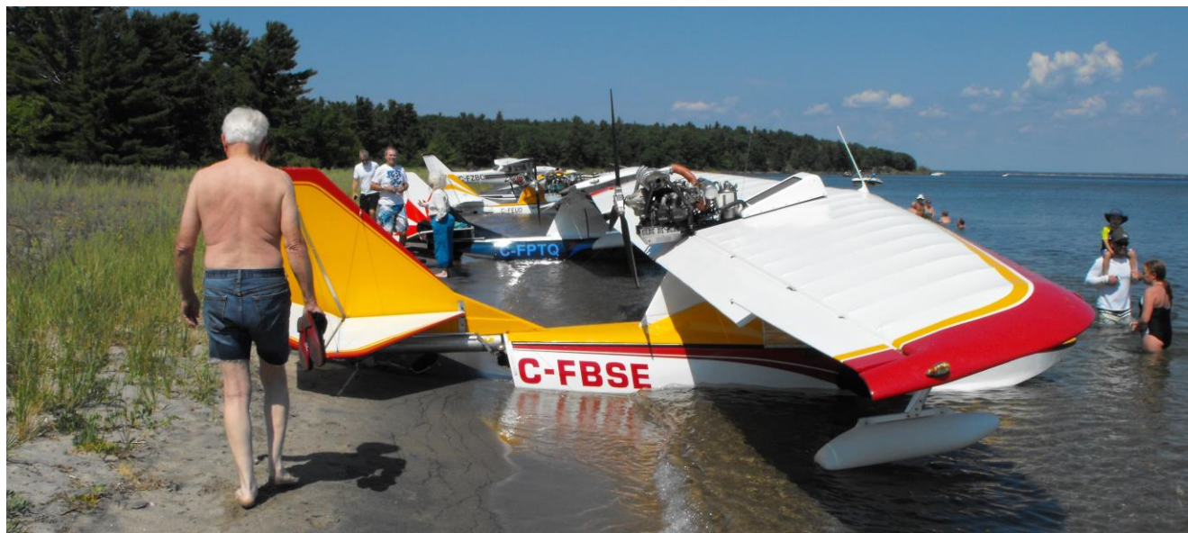
A gaggle of Seareys sits on Giants Tomb Island on one of the many "Splashes" arranged during the 2016 Georgian Gaggle. Each day the group flew a different sortie to various locations around the southern part of "The Bay".