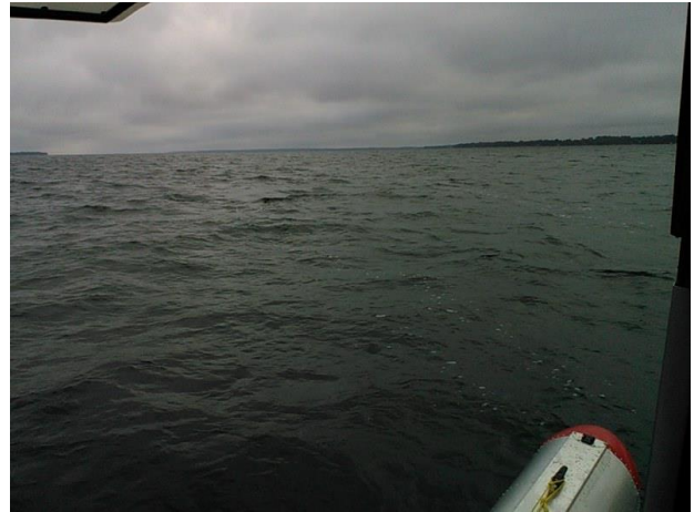
Sitting on the runway, waiting for the ceilings to lift. About two hours later, the sun and wind cleared out the clouds east of Lake Simcoe