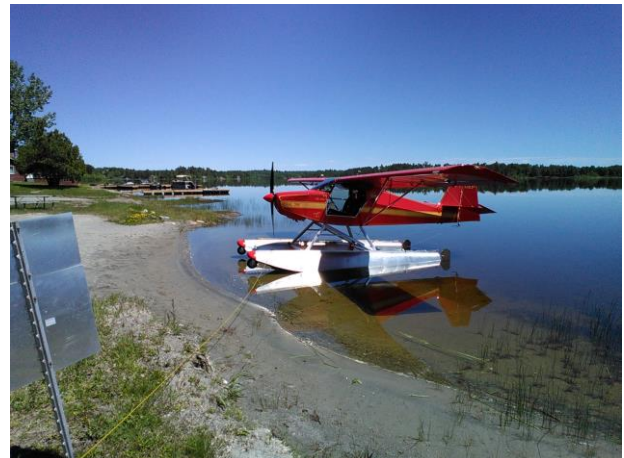
Deer Lake near Verner (between North Bay and Sudbury)

*Disclaimer – I do own a recreational property in BC that is used for skiing during the winter months when float flying is much too challenging in Ontario... ;-)