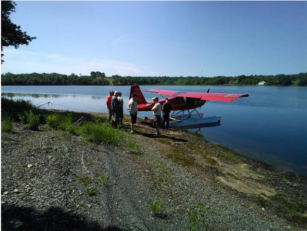
At the seaplane base in New Germany, Nova Scotia