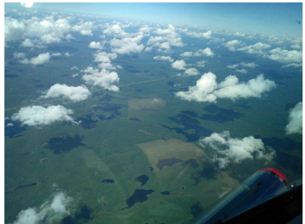
Not much detail on the ground from way up here... The captain is beginning the long descent to Ayleen Lake... Ensure your seats and tray tables are in their full upright position...