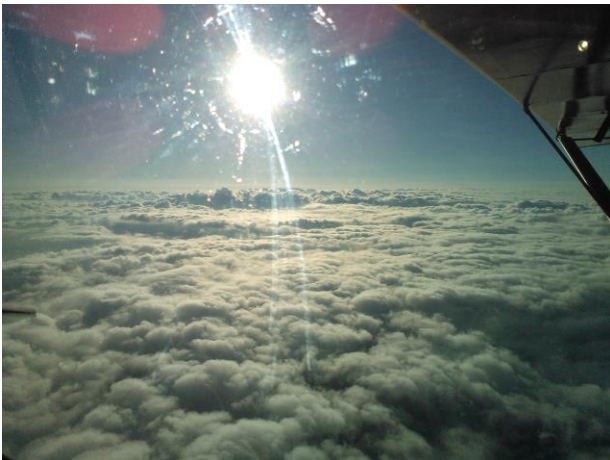
Socketed in east of Lake Simcoe... what next? Even an Over-the-Top rating wouldn't have helped here, but the view was interesting looking at the cloud tops from the clear skies to the west of Lake Simcoe