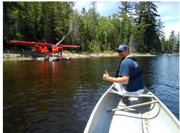
Fishing for Bass in a small lake northeast of Sudbury