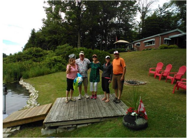
Friends on a small private Southern Ontario Lake