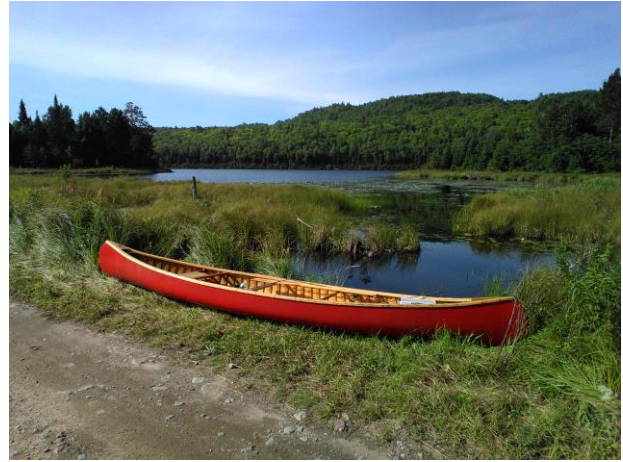
Fishing a remote bass/pike lake with Jack Leroux

One SUV company used the line “You Belong Outside”, but a good floatplane will take you places an SUV can’t possibly get to. Whether your plane is on floats or wheels, get out and explore! There’s so much to see and do in this