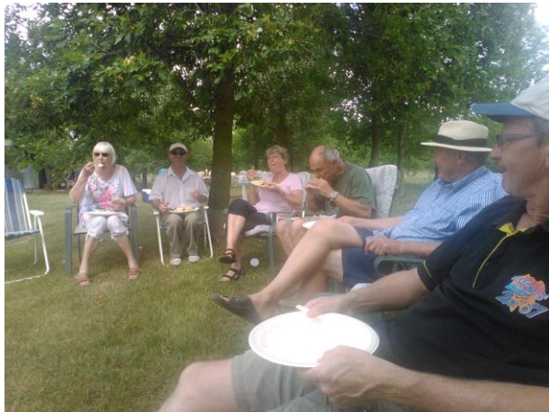
Good friends and good food... good times!