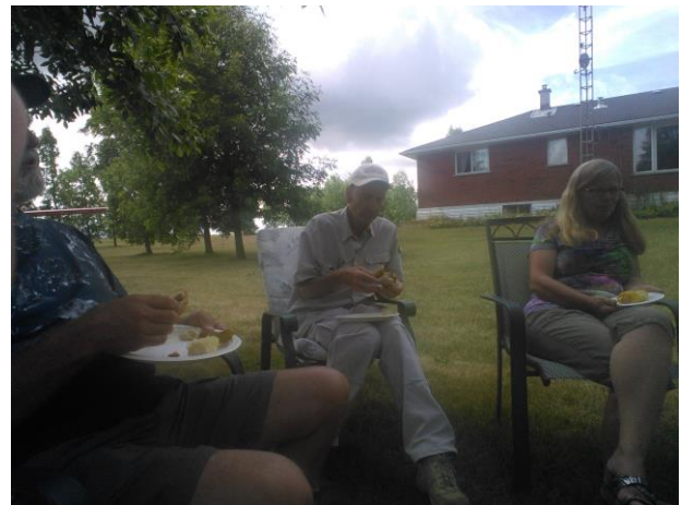
Comfortable temperatures and broken clouds