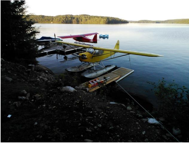
Visiting Jack Leroux on Aylen Lake near Algonquin

One SUV company used the line “You Belong Outside”, but a good floatplane will take you places an SUV can’t possibly get to. Whether your plane is on floats or wheels, get out and explore! There’s so much to see and do in this