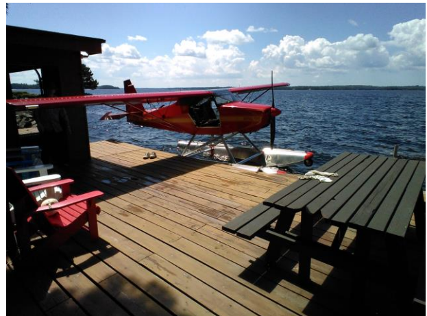
Visiting relatives near Bracebridge on Lake Muskoka