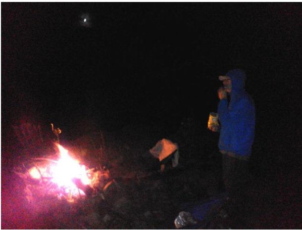
Corn on the cob roasting in the campfire on a remote lake after a bit of rain on a camping trip with G. Walsh