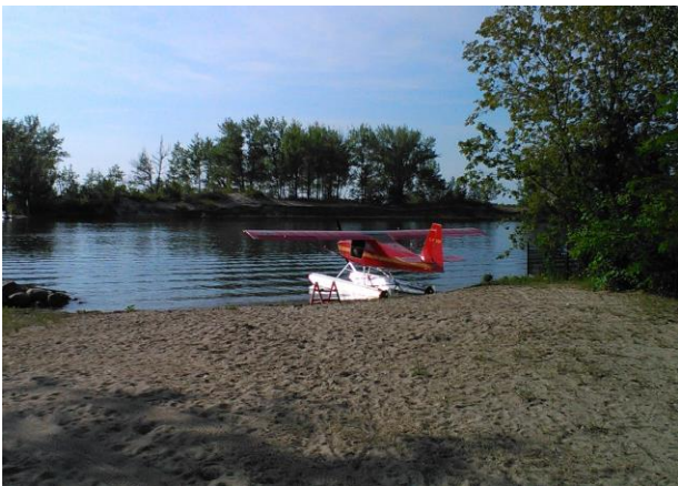
On the beach near the mouth of the Nottawasaga River during the Georgian Gaggle 2016. I departed directly from there after the Thursday night BBQ.