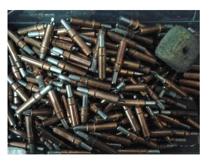
Clecoes after my handy clean-up trick!

I found that a few of the older clecoes had some epoxy on them from a prior project and the crepe block did not work to clean the epoxy off. However, if you are faced with cleaning up a bunch of clecoes you used during a float sealing operation, try this simple trick to get them looking almost new again!