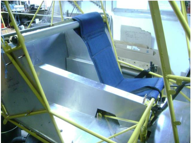
Mission accomplished for about $45 in parts. Here is a shot of the finished centre console in the Pegazair.

The height of lift I was able to get was 3/16", which far exceeds the brake's capacity (unless you're talking cardboard). So far, I've been able to get very straight bends of 40" with .025" 6061-T6 and .025 mild steel sheet over 30".