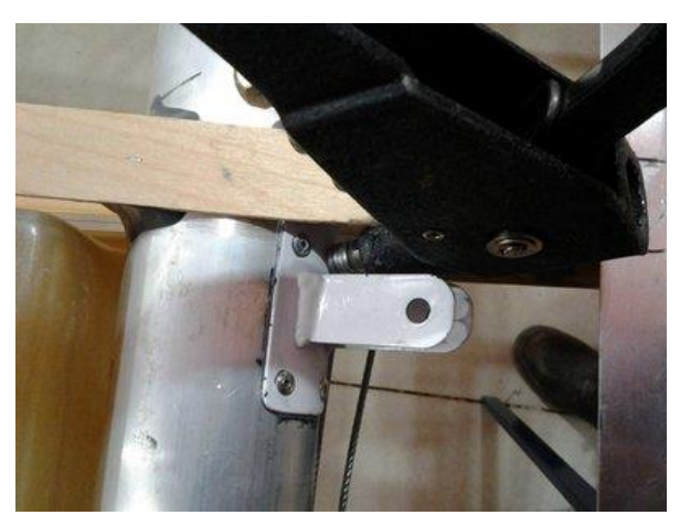
Use rivet washers to extend the reach of the rivet squeezer. It works well up to about 1/3" after which the tool cannot get a good grip on the rivet shaft.