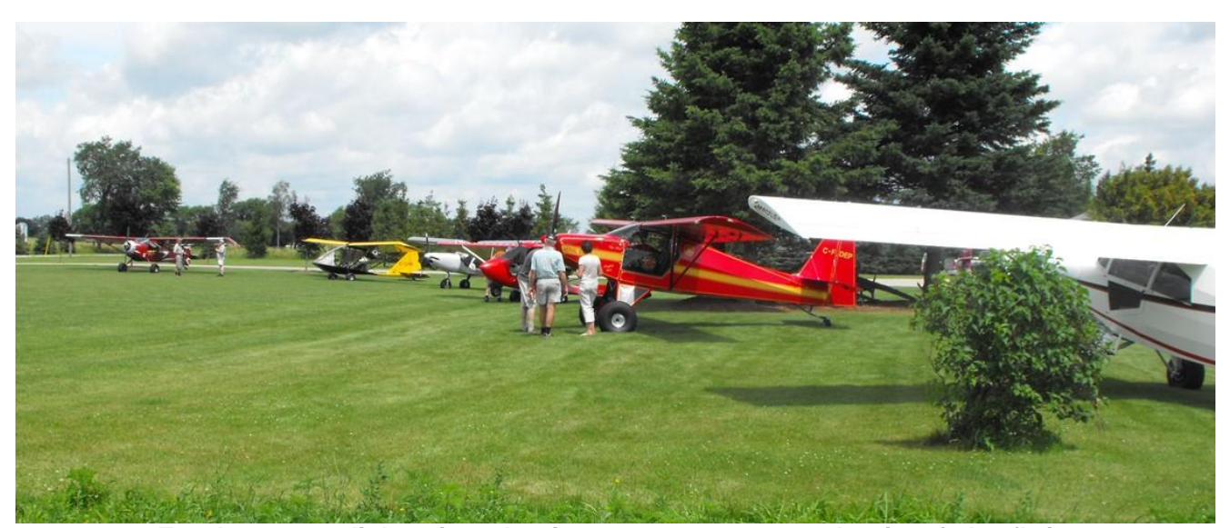
Tom has a great little strip and a nice grass area to set up the aircraft that fly in.

Be There! It's always a great event. - Dan