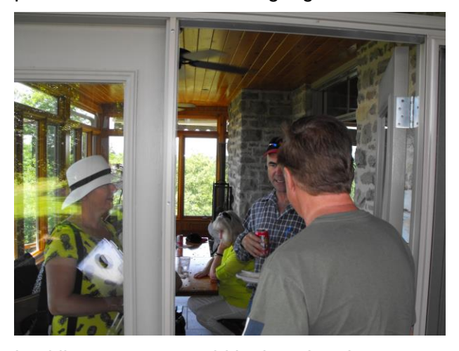
Luckily, everyone could look at the planes...

Anyone who dared cover up their RAA hat with sun glasses or wear a hat that did not sport an RAA logo had to sit in a stone and glass cage and was prevented from leaving by a bilingual guard until they could guess the secret password in both official languages.