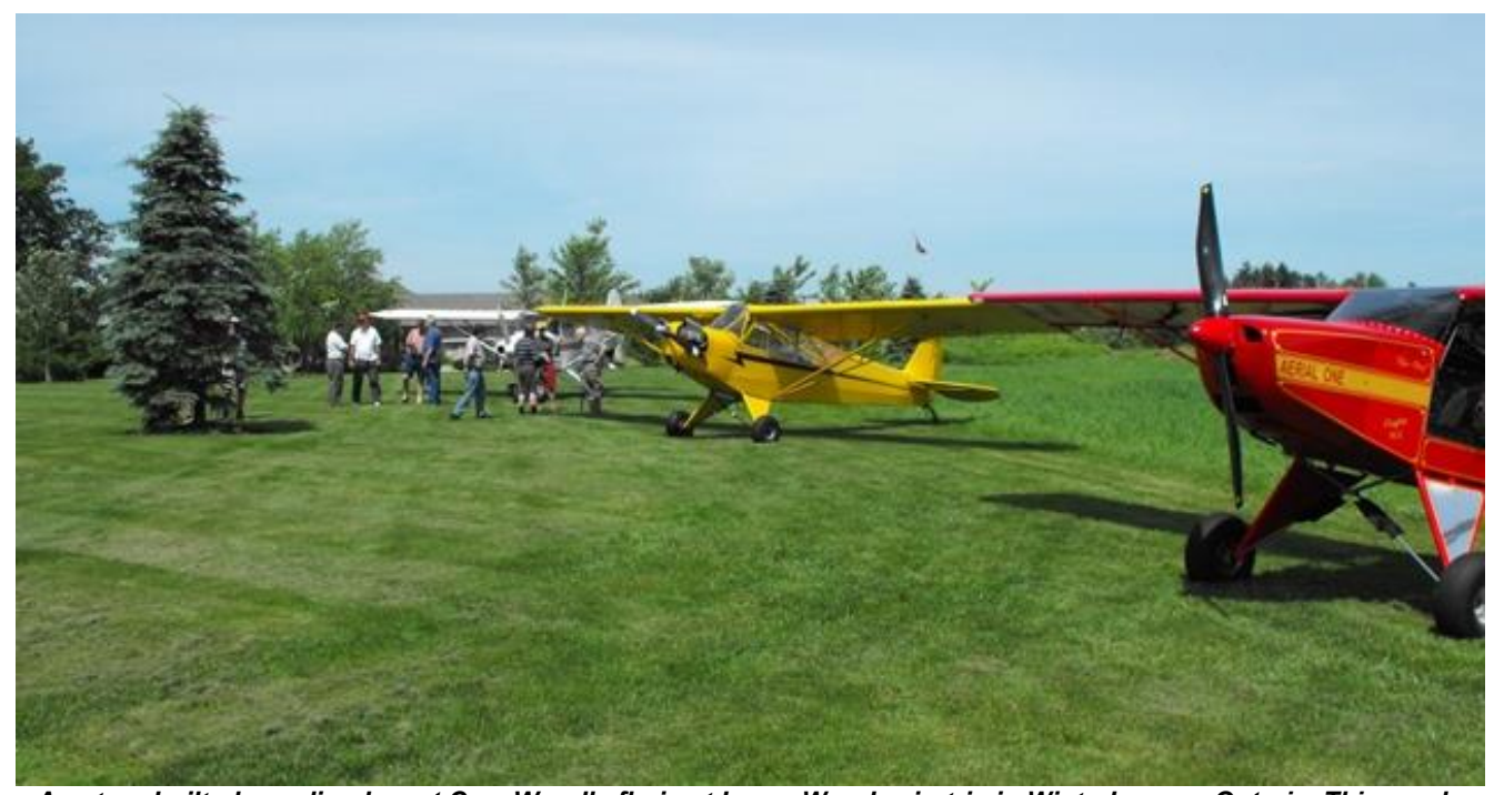
Amateur built planes lined up at Cam Wood's fly-in at Largo Woods airstrip in Winterbourne, Ontario. This year's fly-in was another success with a large number of KWRAA members in attendance and a few of their wives as well.