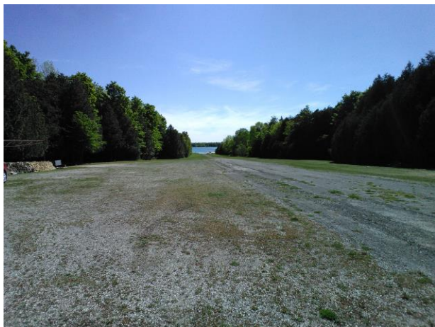
Looking back towards Williams Lake from mid-runway at Glendale Aerodrome near Chatsworth

In the 70's Glendale Aerodrome, on Williams Lake was in its hay day with as many as twenty or so aircraft calling it home. Today, it still exists and is much less well known, but it is still a great place to visit.