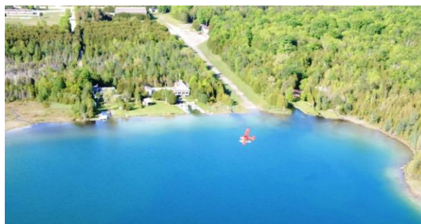
Flying over Williams Lake, the unusual shade of blue in the water is your first clue you are someplace very special and unique.

Williams Lake covers 148 acres and an unusual clover-shaped body of water which was named after the Williams family that owned a large portion of the land surrounding the lake. A railroad was built to Williams Lake in 1899 in order to dig up the grey-white muck known as 'marl' which is prominent at the lake. The marl or marlstone was quarried by a company in Owen Sound as an ingredient in their cement. The marl, which is similar to the chalk and limestone found in the white cliffs of Dover, UK, give Williams Lake its unusual shade of blue.